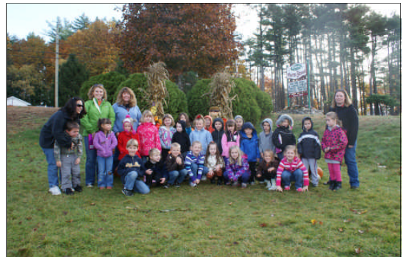
Pumpkin picking at Wilson's Farm Stand with the AM Kindergarten classes.

The kindergarten classes have been exploring the great learning experiences our community has to offer; through a field trip to Wilson Farms to pick pumpkins. The students were thrilled to get a first-hand look at how pumpkins grow, as we have been learning about the life cycle of a pumpkin. We also enjoyed the very creative Scarecrows at the Jamboree and celebrated Halloween together.